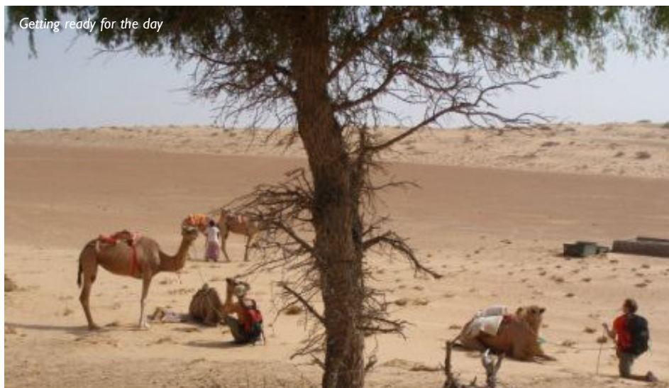
Getting ready for the day