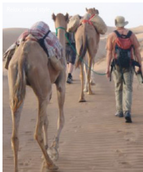
Relax about style

Breakfast, lunch, dinner, wild desert camp